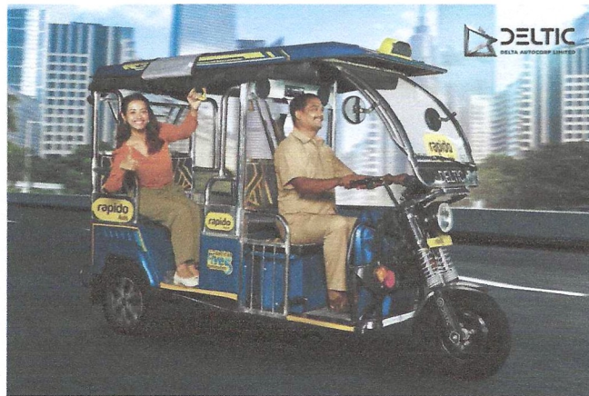
Deltic recently tied up with Rapido. The attached images are of Rapido's official photoshoot with Deltic's vehicles at IPL 2025 launch ceremony

DELTIC is the one of the first brands to partner with RAPIDO to provide high-quality electric 3-wheelers and electric scooters in a range of models and colors for transportation, delivery, and revenue-generating rides. Traditionally, electric 3-wheeler drivers face long waiting times at various pick-up points before they can find passengers. However, thanks to DELTIC's collaboration with RAPIDO, DELTIC customers can immediately register on RAPIDO's platform with no fees, ensuring they receive consistent passenger demand and minimal wait times, significantly increasing their daily earnings. Through this partnership, DELTIC is indirectly creating employment opportunities for thousands of its E-Rickshaw drivers. Additionally, Electric Scooter riders can earn extra income by enrolling on the RAPIDO platform and registering as a captain.